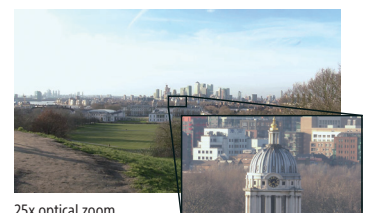
25x optical zoom